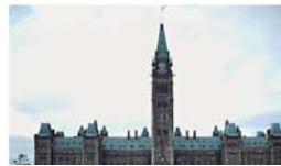
Around the Peace Tower