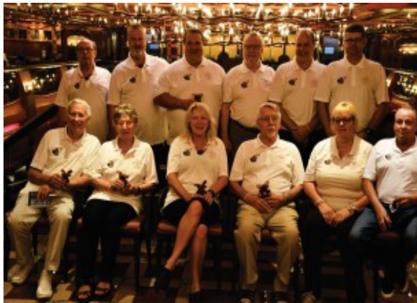
Team Canada Nations Cup 21. EM 2019